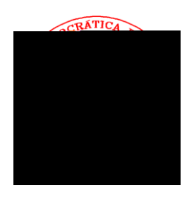
DECREE-LAW No. 40/2023, of 31 May LEGAL METROLOGY